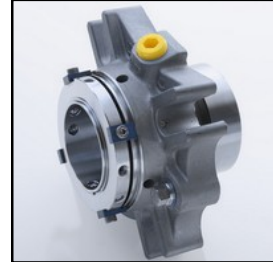
EagleBurgmann. Rely on excellence

can seem to fix, don't forget to have Johnson Packings and EagleBurgmann quote the job!